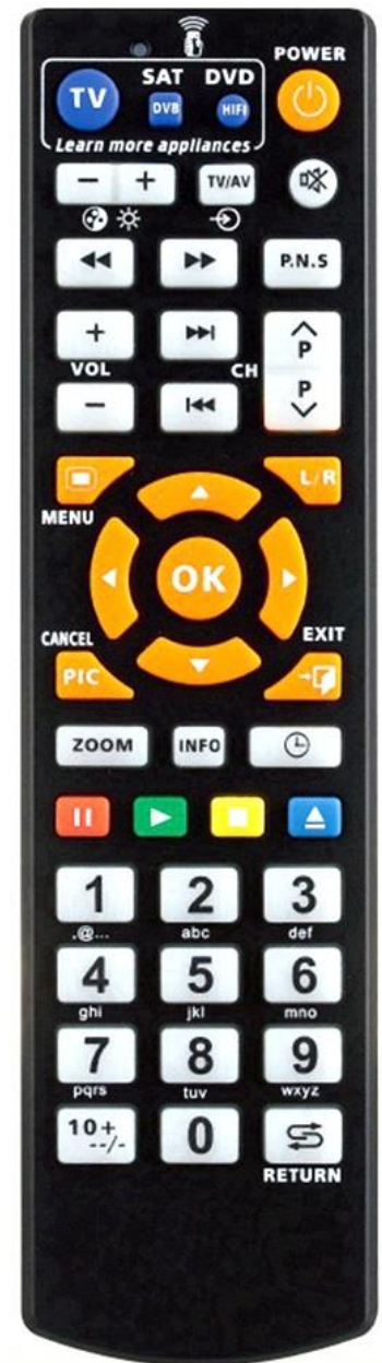
100% Arduino Compatible Remote

To make KONTROLIR, we buy-in small batches of these existing remotes and replace the PCBs with our own Arduino compatible one. We also reuse as many of the original components as possible. Consequently, KONTROLIR will have some unrelated branding from the original device (Not displayed in Image). There may also be some slight colour variations between batches.